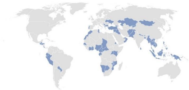
Countries which have benefited from Well-Governed SAIs Workstream activities

Good governance of an SAI is fundamental for ensuring SAI credibility, effectiveness and delivery of high-quality audits that have societal impact. INTOSAI P-12 highlights the need for SAIs to, among others, periodically assess their performance and have robust organisational management structures and practices, including risk management. Such attributes are essential for SAIs that strive to make a difference and act as model institutions for accountability and transparency. Therefore, the Well-Governed work stream aims to support SAIs in key governance areas.