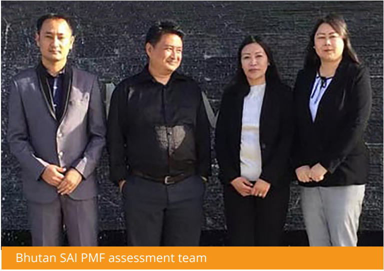
Bhutan SAI PMF assessment team

Importantly, the assessment provided input to the further improvement of the SAI PMF framework to the benefit of the INTOSAI community.