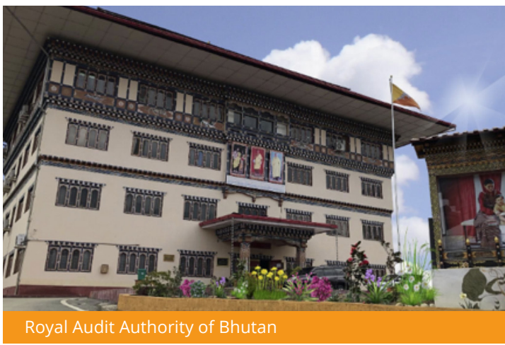
Royal Audit Authority of Bhutan

Committed leadership and staff tackled the results of the assessment head-on, appreciating the strong performance areas identified while accepting the weaknesses. The RAA used this insightful knowledge constructively to develop the SAI Strategic Plan (2015-2020) and as a tool to facilitate communication with donors. By demonstrating its dedication to improve, the RAA received further donor support from the World Bank and the Austrian Development Agency where the SAI PMF results ensured support was targeted towards the real needs of the SAI. The funds were used to address gaps in the audit methodologies to further strengthen the implementation of the ISSAIs.