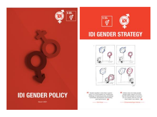
IDI Gender Policy and Gender Strategy

The IDI Gender Focal Point (GFP) in SSU continued to spearhead IDI's gender work and support to IDI staff and SAIs in applying a gender lens. This is based on IDI's Gender Strategy and Action Plan and IDI's Gender Policy. Four IDI Gender Champions strongly supported these efforts. Based on the IDI Gender Accountability Framework this is a shared responsibility for everyone in IDI. In addition, 2022 marked a year where IDI started to work on making sustainability a strategic priority in the upcoming Strategic Plan. Building on successes of applying a gender lens and continuing its gender and inclusion work<sup>2</sup>, IDI wants to go broader and look at all