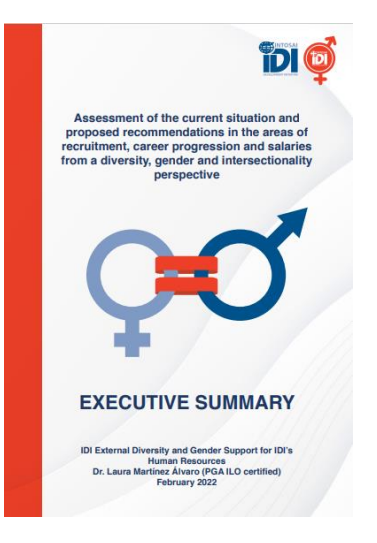
Executive Summary of IDI's HR assessment focusing on gender, diversity and intersectionality