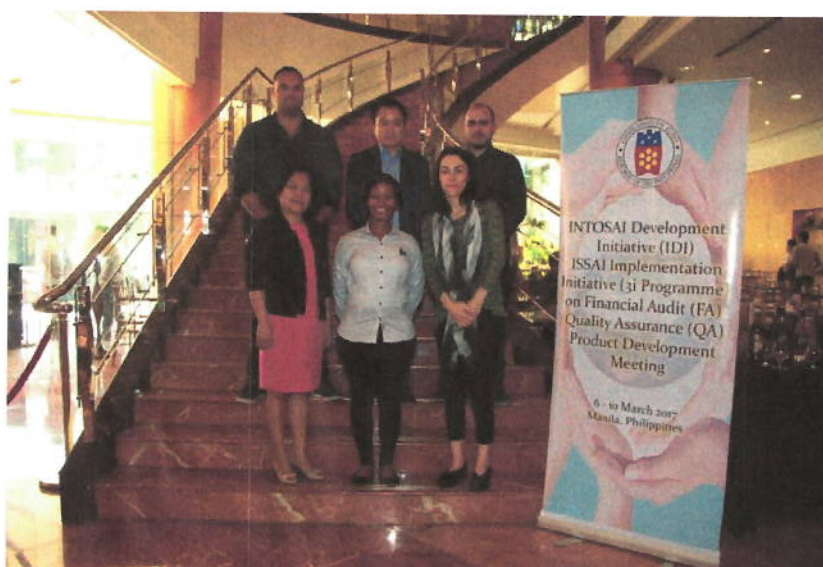
Resource persons at the Product Development Meeting for Financial Audit Quality Assurance at Manila, Philippines

This eLearning course being conducted from 3 April to 26 May 2017 is the first activity of the IDI-ASOSAI Certification Programme for eLearning specialists. The objective of the programme is to enhance capacity in SAIs of ASOSAI region in design, development and delivery of eLearning course. This certification programme is based on a