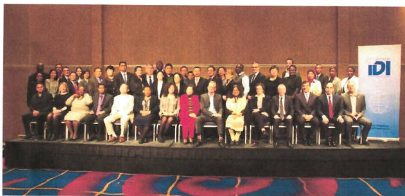
Participants at the Lessons Learned Meeting on Audit of Lending and Borrowing Frameworks at Oslo, Norway