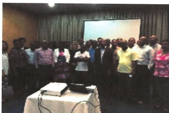
Participants at Lessons Learned Meeting and Planning Workshop for Second Round of Pilot Project Audits, Programme on Audit of Externally Funded Projects in Agriculture and Food Security Sector