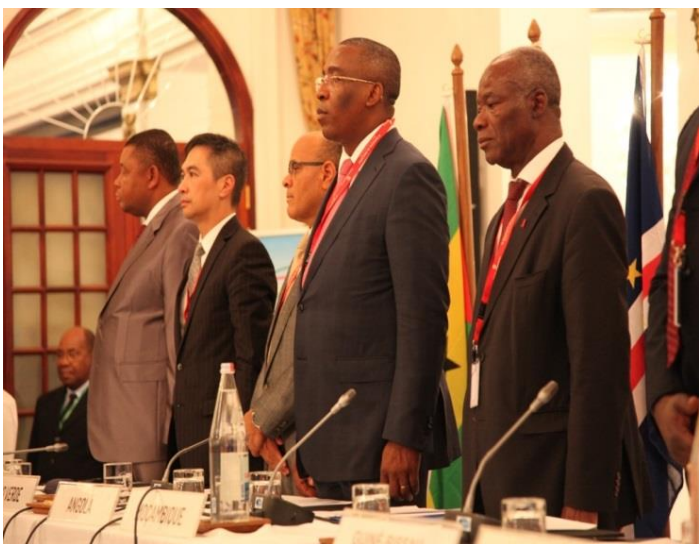
Representatives at the IV OISC/CPLP General Assembly.

The first Portuguese SAI PMF training course was a pilot version endorsed by the Brazilian Federal Court of Accounts in collaboration with IDI. It took place in May 2014, in Brazil, and was attended by 12 representatives from SAIs from the Portuguese-speaking African Countries (PALOP) and Timor-Leste sponsored by the project to be trained as trainers. The training also generated feedback to improve and customize the SAI PMF modules to the reality of the PALOP and Timor-Leste. The second training took place in Mozambique, from 8 to 12 June 2015, back-to-back with the IV OISC/CPLP General Assembly (GA). 20 auditors attended the training aimed to enhance training skills and develop a pool of Portuguese SAI PMF trainers able to train other professionals. The course resources were translated with Pro PALOP-TL SAI funding.