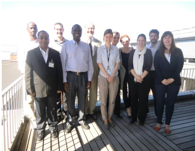
Participants at the Task Team Meeting in Oslo

The Task Team will meet again in October to prepare suggestions for necessary amendments to the tool. When revising the tool, the Task Team is paying due consideration to striking the right balance between