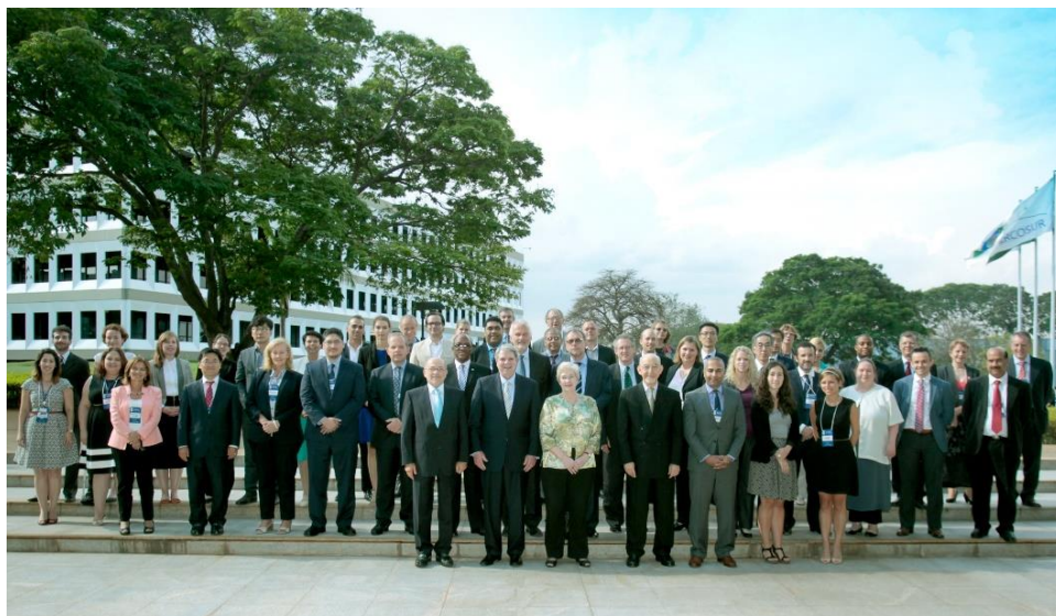
Participants at the 8th INTOSAI-Donor Steering Committee meeting in Brasilia.

SAIs by funding an IDI/AFROSAI-E IFAD support programme on Audit of Externally Funded Projects in the Agricultural and Food Security Sector. Further, IFAD engages SAIs in a variety of countries to audit the projects and programmes it finances. Involvement with the INTOSAI-Donor Cooperation will assist IFAD to enhance the way in which it engages with SAIs, to combine meeting its own fiduciary responsibilities with the capacity development needs of SAIs.