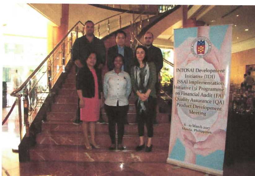
Resource persons at the Product Development Meeting for Financial Audit Quality Assurance at Manila, Philippines

This eLearning course being conducted from 3 April to 26 May 2017 is the first activity of the IDI-ASOSAI Certification Programme for eLearning specialists. The objective of the programme is to enhance capacity in SAIs of ASOSAI region in design, development and delivery of eLearning course. This certification programme is based on a