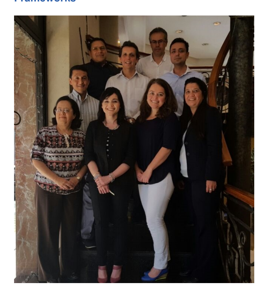
Participants at the Quality Assurance meeting for OLACEFS region